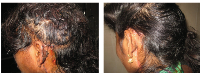
[Table/Fig-9]: Immediate post-operative picture [Table/Fig-10]: Three months follow-up picture